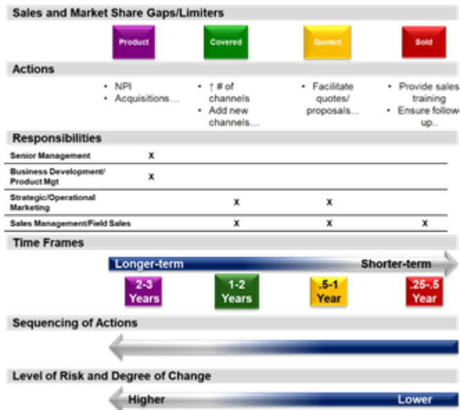
Figure 3—Insights from the PPH® Model

Through the discipline of the PPH® framework, business unit teams gain insight into the mix and value of the issues that limit the company’s sales and market share. This insight informs the requirements for its growth plan and helps the team understand whether it can focus on improving the effectiveness of its existing marketing and sales resources or whether it must invest to expand them as a means to meet the company’s growth aspirations.